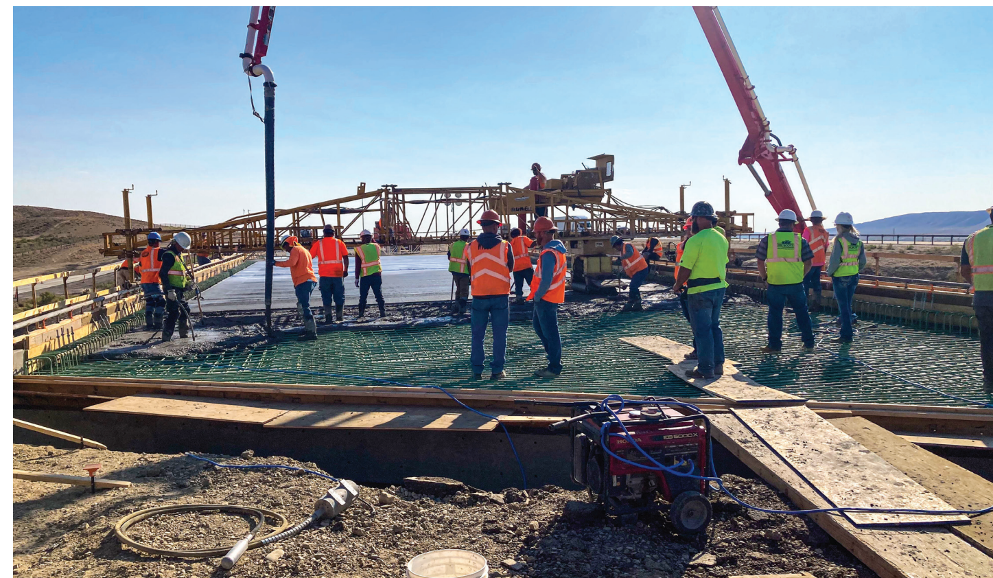
A crew with IHC Scott work on pouring concrete for a bridge deck at the Baxter Interchange on I-80 east of Rock Springs. The contractor and WYDOT were awarded an Excellence in Concrete Paving award this year by the Colorado/Wyoming chapter of the American Concrete Paving Association.