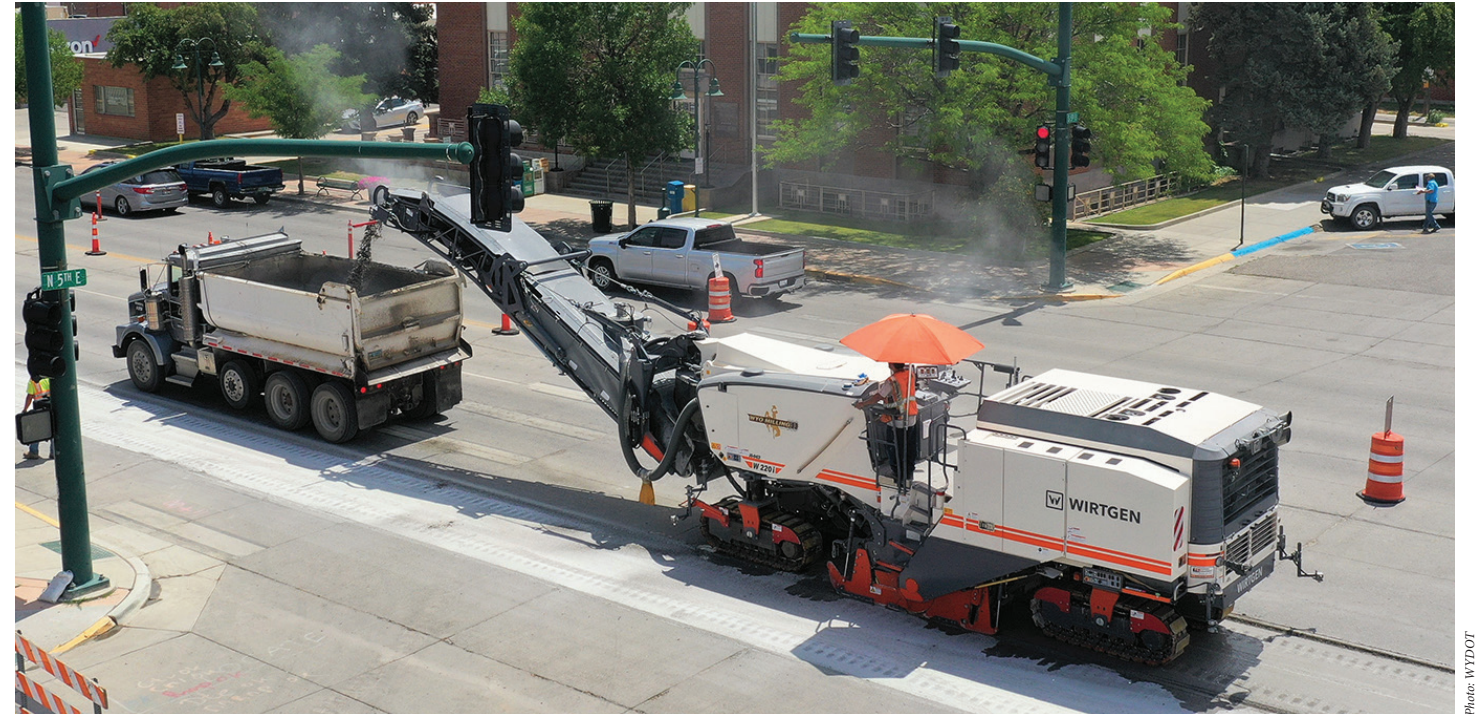
A milling operation on Main Street in Riverton.