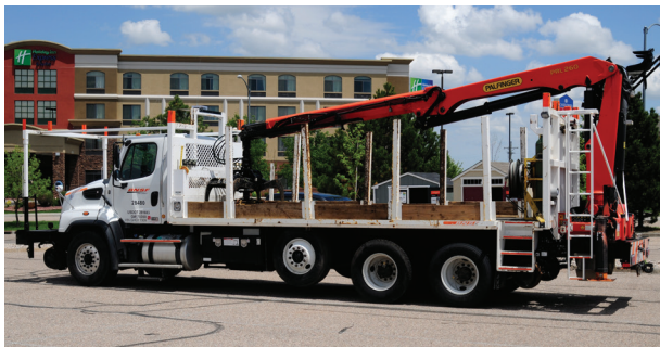
Single Unit Vehicle - 4 axles