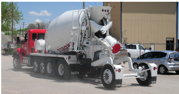
Single Unit Vehicle - 6 axles