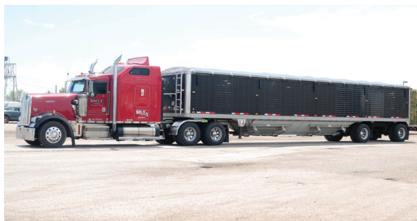
Semi-Trailer Combination - 5 axles