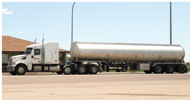
Semi-Trailer Combination - 7 axles