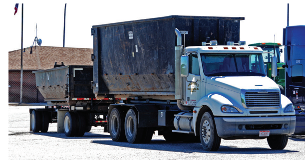
Truck & Full Trailer Combination - 5 axles