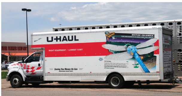
Single Unit Vehicle - 2 axles