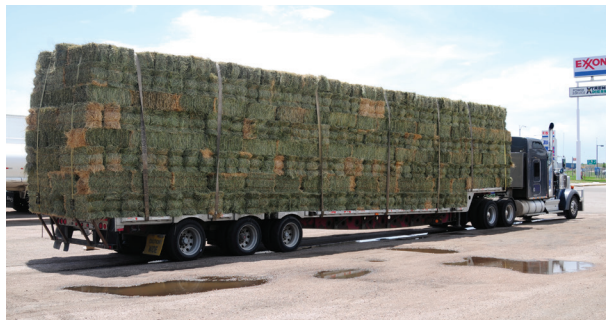
Semi-Trailer Combination - 6 axles